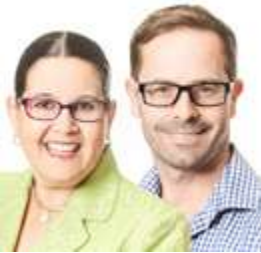
THE PHARMACY INNOVATION TEAM

For the design and implementation of mixed mode intensive Anatomy and Physiology courses to enhance student engagement and academic recovery in large first year health cohorts.