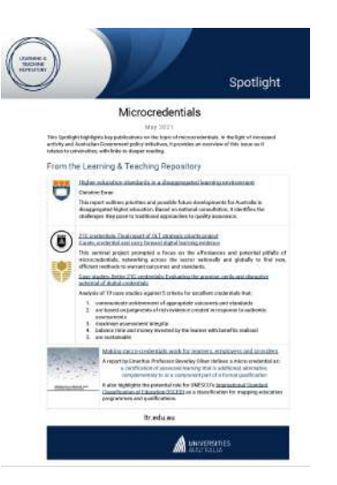
Micro Credentials Spotlight