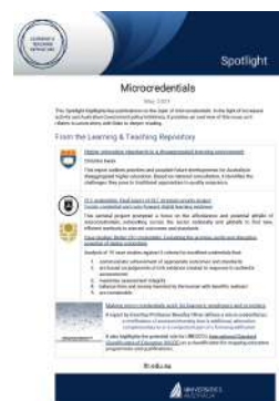
Micro Credentials Spotlight