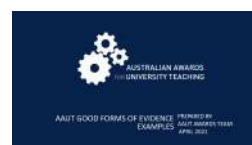
Good forms of evidence examples