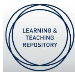
Learning and Teaching Repository