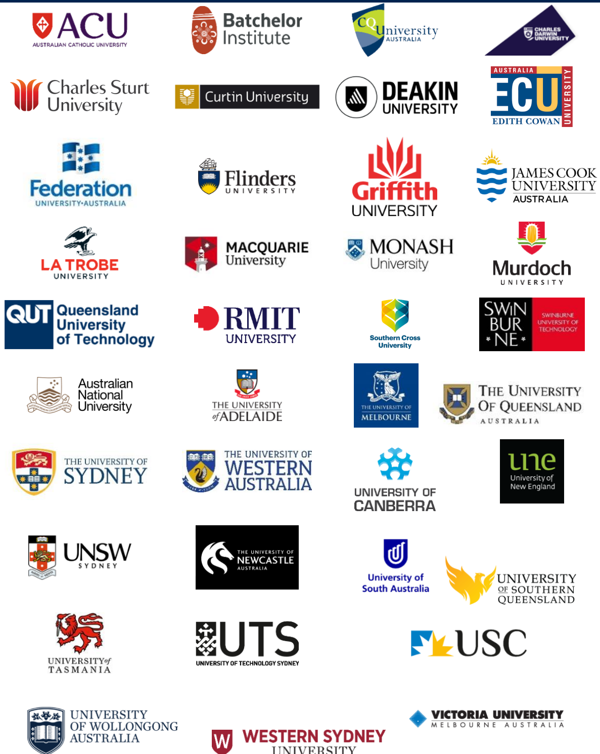
TABLE B PROVIDERS