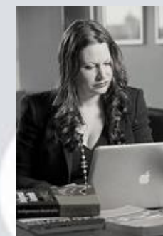
2002 Prof. Larissa Behrendt, UTS & Prof Macia Langton, UoM (Teaching Excellence)