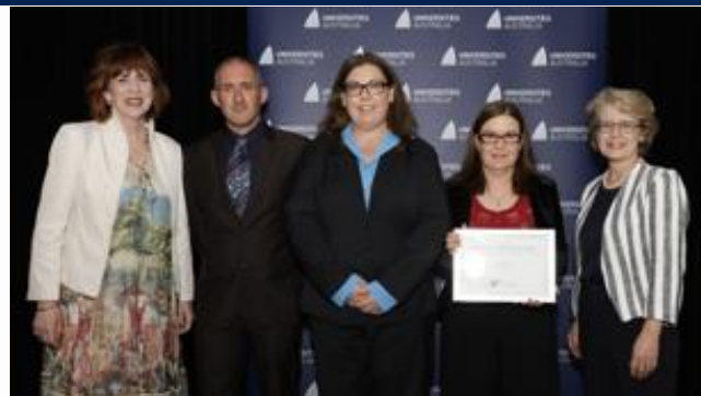
2018 CAIK Team, UTS (Teaching Excellence)