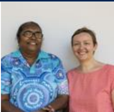
2020 Kujarra Mapu Muwarr Wakajku Team, Uni of Notre Dame (Citation)