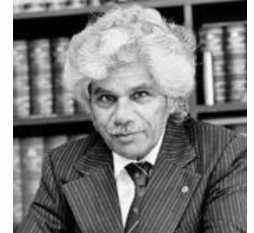
Neville Bonner AO 1922 to 1999