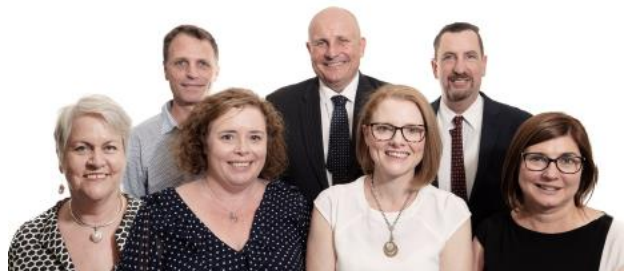
Kirakira Program, Bond University

Many universities look to develop and foster knowledge through research and innovation while expanding their global impact. The Bond University Kirakira program is distinctive in that it embeds and promotes these efforts through interprofessional work-integrated placements in a remote community. To date, this program has supported 240 medical, allied health and sustainable development students and faculty supervisors to engage with this community in Solomon Islands.